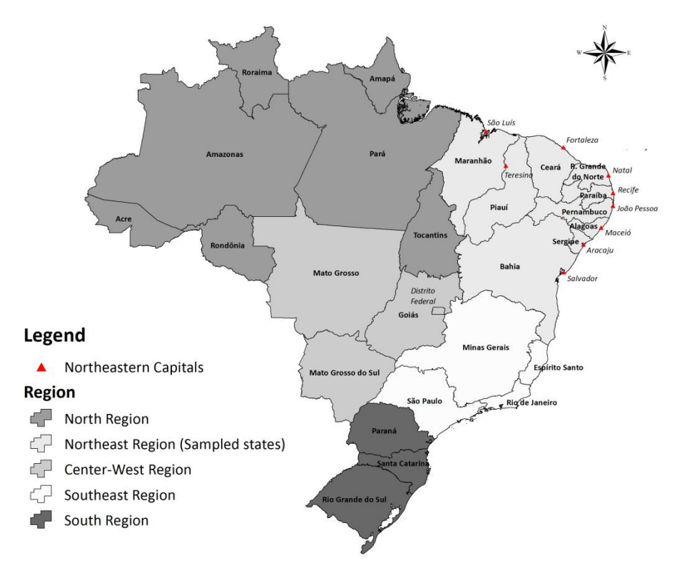
Figure 1: Geographical coverage of the PCSVDF<sup>Mulher</sup> survey

The sampling plan was drawn up by stratifying the population of households in three stages. In the first stage, there was a random selection of a sample of census tracts at each state's capital following a design that creates three layers of sectors according to the head of household's average income per capita in the sector. In the second stage, there was a random selection of a sample of households at each of the sectors selected at the previous step. Finally, in the third stage, and to ensure the safety and confidentiality of respondents, only one woman aged 15-49 was randomly selected per household. Figure 1 shows the geographical coverage of the PCSVDF<sup>Mulher</sup> survey.